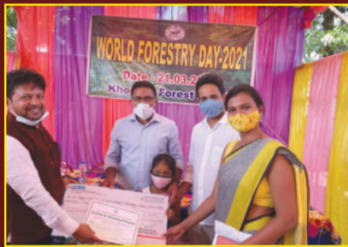
Chairman, NIET received World Forestry Award from Khorda Forest Division-2021