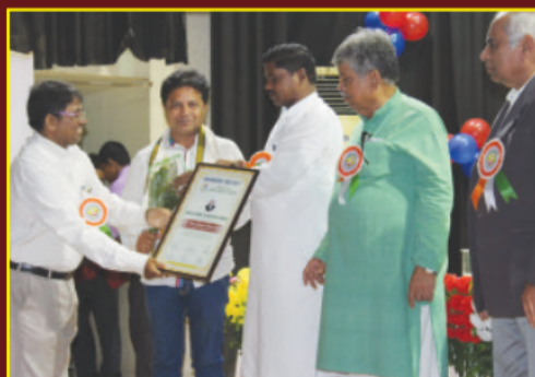
Chairman, NIET received MSME Award from from Hon'ble Minister S.J. Prafulla Kumar Samal